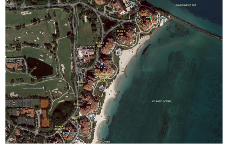
Built in 1989/2002 - 233 units - 9 floors

Fisher Island Community Association Address: 1 Fisher Island Dr, Miami Beach, FL 33109 Phone: +1 305-535-6000 https://www.fisherislandfica.com/