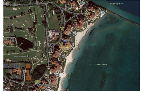
Built in 1989/2002 - 233 units - 9 floors

Fisher Island Community Association Address: 1 Fisher Island Dr, Miami Beach, FL 33109 Phone: +1 305-535-6000 https://www.fisherislandfica.com/