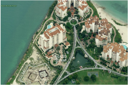
Built in 2008 - 29 units - 10 floors