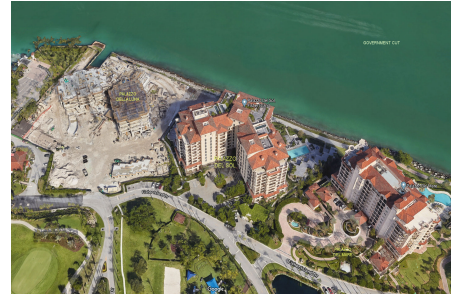
Built in 2016 - 43 units - 10 floors

Palazzo Del Sol Address: 7000 Fisher Island Dr, Fisher Island, FL 33109 Phone: +1 305-535-6071