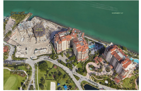
Built in 2016 - 43 units - 10 floors

Palazzo Del Sol Address: 7000 Fisher Island Dr, Fisher Island, FL 33109 Phone: +1 305-535-6071