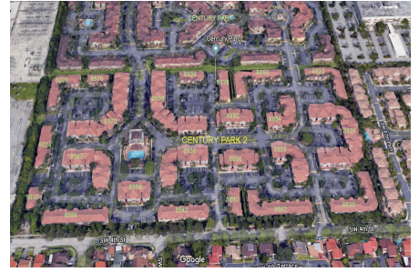
Built in 2002 - 373 units - 3 floors

Century Pk II 8950 W Flagler St, Miami, FL 33174 (305) 220-1715