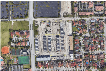
Built in 2018 - 131 units - 2 floors

Century Park Place Townhomes Address: SW 4th Street, SW 92nd Ave, Miami, FL 33174 Phone: +1 305-599-8100