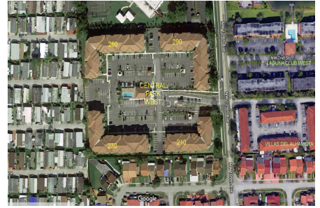
Built in 2016 - 135 units - 3 floors