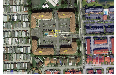
Built in 2016 - 135 units - 3 floors