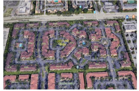
Built in 2001 - 317 units - 3 floors

Century Parc Address: 8950 W Flagler St, Miami, FL 33174, Phone: +1 305-220-1715