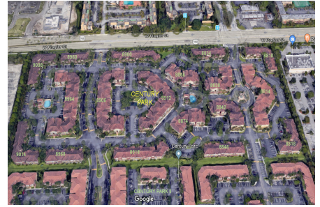
Built in 2001 - 317 units - 3 floors

Century Parc Address: 8950 W Flagler St, Miami, FL 33174, Phone: +1 305-220-1715