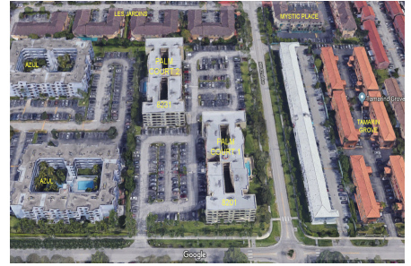
Built in 1987 - 136 units - 5 floors

Palm Court Of Miami Condominium Association, Inc 8201 NW 8th Street Miami, FL 33126 Phone: (305) 264-2633