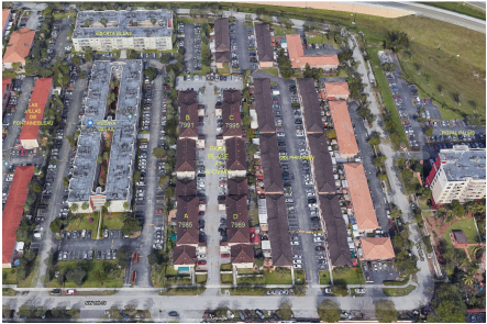
Built in 2007 - 57 units - 3 floors