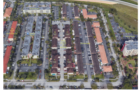
Built in 2007 - 57 units - 3 floors

Number of units: 57 Number of active listings for rent: 1 Number of active listings for sale: 0 Building inventory for sale: Number of sales over the last 12 months: 0% Number of sales over the last 6 months: 2 Number of sales over the last 3 months: 1