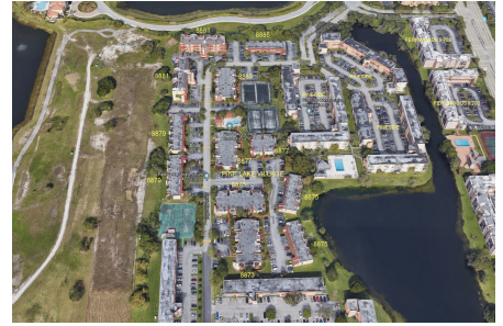
Built in 1980 - 198 units - 5 floors

Pine Lakes Village Condominium Association 8877A Fontainebleau Blvd, Miami, FL 33172 (305) 227-3553 8883 Fontainebleau Blvd, Miami, FL 33172 (305) 227-1135