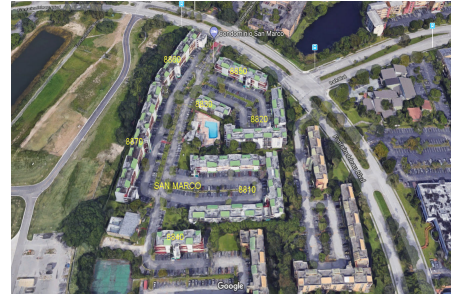
Built in 1971 - 276 units - 5 floors