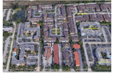
Built in 1998 - 112 units - 2 floors

Secret Gardens Condominiums Association Address 8330 NW 10th St Miami, Florida 33126 Phone +1 305-265-7725