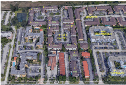
Built in 1998 - 112 units - 2 floors

Secret Gardens Condominiums Association Address 8330 NW 10th St Miami, Florida 33126 Phone +1 305-265-7725