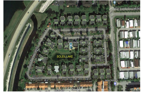
Built in 1986 - 240 units - 2 floors