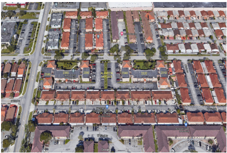
Built in 1991 - 44 units - 2 floors