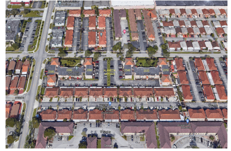
Built in 1991 - 44 units - 2 floors