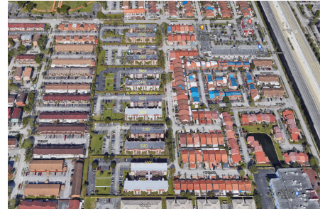
Built in 1988/90 - 312 units - 4 floors

Alameda Tower 1 Condominium Association, Inc 5300 West 21st Court Hialeah, FL 33016 (305) 819-2361 Alameda Tower IV Condominium 5500 W 21st Ct, Hialeah, FL 33016, +1 305-817-8873