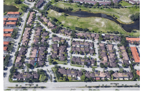
Built in 2005 - 120 units - 2 floors

Number of units: 120 Number of active listings for rent: 1 Number of active listings for sale: 0 Building inventory for sale: Number of sales over the last 12 months: 0%% Number of sales over the last 6 months: 0 Number of sales over the last 3 months: 0