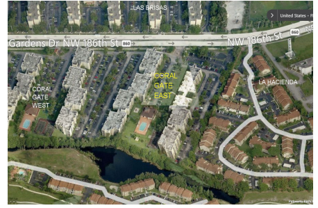
Built in 1974 - 356 units - 5 floors

Coral Gate East Condominium 6952 NW 186th St, Hialeah, FL 33015 (305) 362-5852