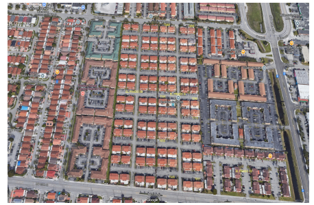
Built in 1990 - 220 units - 2 floors

El Prado XVI Condominium Address: W 36th Ave, Hialeah, FL 33018