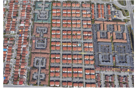
Built in 1991 - 224 units - 2 floors