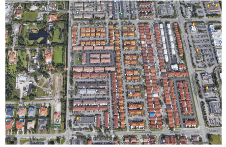
Built in 1994 - 290 units - 2 floors

El Prado XV 7998 W 34 Ln, Hialeah, FL 33018