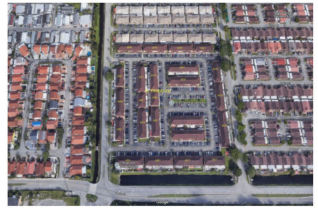
Built in 1996 - 184 units - 2 floors

El Prado XVI Condominium Address: W 36th Ave, Hialeah, FL 33018 Trust Management Services Group 8051 W 24th Ave #10, Hialeah, FL 33016 305-827-7666