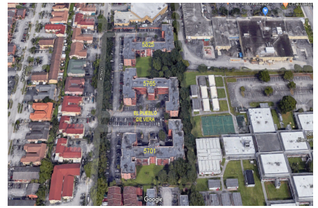
Built in 1989 - 144 units - 4 floors

El Pueblo De Vera Condominium Association Inc 1450 NW 87th Avenue 204 Doral,