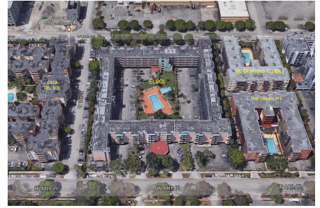
Built in 1972 - 220 units - 5 floors

El Sol Condominium Association Inc 1655 W 44th PI Hialeah FL 33012-8407 (305) 512-1751