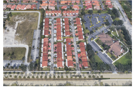
Built in 1996 - 53 units - 2 floors