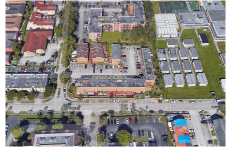
Built in 1991 - 47 units - 3 floors