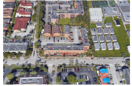
Built in 1991 - 47 units - 3 floors