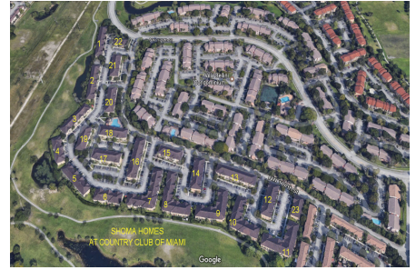
Built in 2002 - 406 units - 2 floors

Shoma Homes At Country Club Of Miami Condominium 17800 NW 73rd Ave Hialeah, FL 33015 Phone: (305) 928-2738