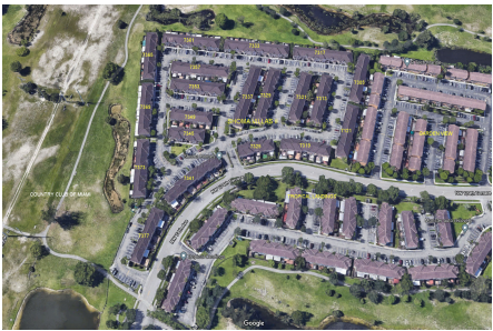
Built in 2004 - 159 units - 2 floors

Shoma Villas II at Country Club of Miami A Condominium Association Managed by Exclusive Property Management Group (786) 585-3801 https://www.shomavillas2.com/