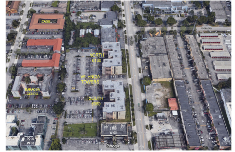
Built in 1991 - 96 units - 6 floors

Valencia Towers Condominium Association, Inc 1275 West 47th Place # 310 Hialeah, FL 33012 Phone: (305) 819-7300