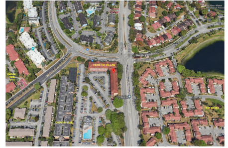
Built in 2005 - 44 units - 4 floors

Venetia Villas Condo Association Address: 17350 NW 67th Ave APT 304, Hialeah, FL 33015 Phone: +1 305-828-5728 https://www.venetivillas.com/