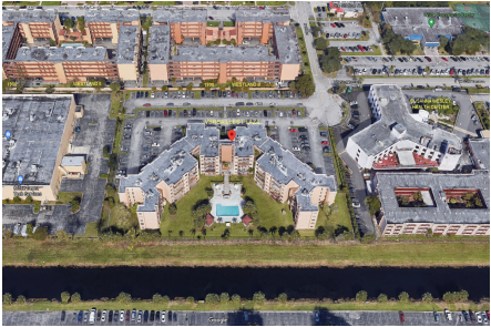
Built in 1985 - 96 units - 5 floors