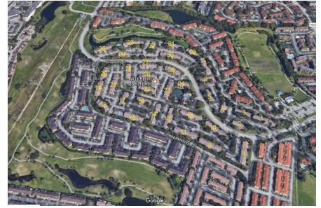
Built in 1986 - 856 units - 3 floors

Villa Bellini Condominium Association Address: 7050 NW 179th St, Hialeah, FL 33015 Phone: +1 305-821-7800