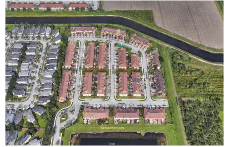
Built in 2008/2013 - 113 units - 2 floors