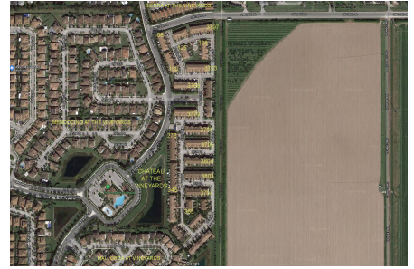
Built in 2007/2017 - 166 units - 2 floors

Chateau At The Vineyards Homeowners Association, Inc. Address: 12895 SW 132nd St, Miami, FL 33186