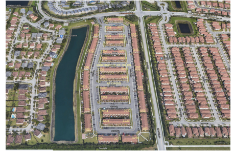
Built in 2014 - 240 units - 2 floors

The Isles at Oasis ?c/o Alton Madison Property Management 381 N Krome Avenue Suite 205 ??Homestead, FL 33033 http://www.theislesatoasis.com/