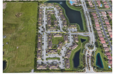
Built in 2005 - 240 units - 2 floors

Monterey at Malibu Bay Address: 920 NE 33rd Terrace, Homestead, FL 33033