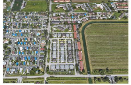
Built in 1982 - 112 units - 2 floors