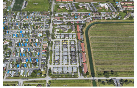
Built in 1982 - 112 units - 2 floors