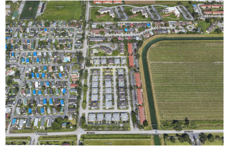
Built in 1982 - 112 units - 2 floors