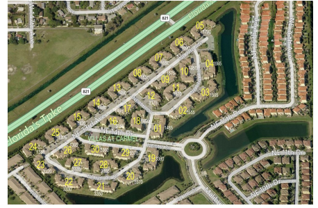
Built in 2005 - 384 units - 2 floors