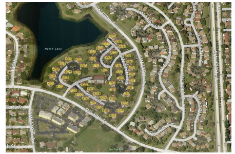
Built in 1976 - 192 units - 2 floors

Bent Tree Center Assoc Inc 13831 Sw 59th St Ste 106 Miami, FL 33183-1150 (305) 380-9020