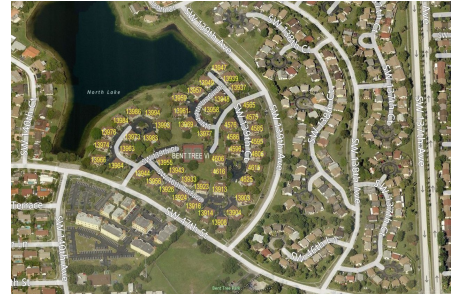
Built in 1976 - 192 units - 2 floors

Bent Tree Center Assoc Inc 13831 Sw 59th St Ste 106 Miami, FL 33183-1150 (305) 380-9020