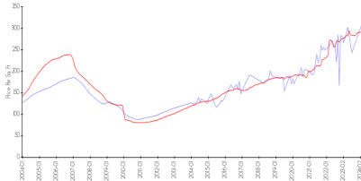
Courtyards at the Crossing vs Kendale Lakes

Courtyards at the Crossing: $319/sq. ft. Kendale Lakes: $302/sq. ft.