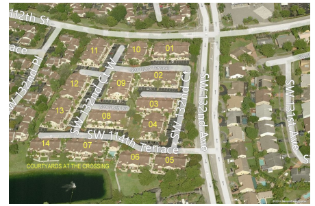
Built in 1984 - 130 units - 2 floors

Number of units: 130 Number of active listings for rent: 0 Number of active listings for sale: 1 Building inventory for sale: 0% Number of sales over the last 12 months: 5 Number of sales over the last 6 months: 1 Number of sales over the last 3 months: 1