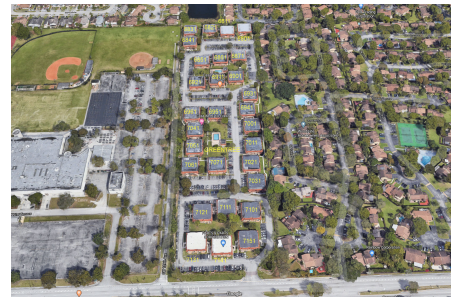
Built in 1983/1993 - 232 units - 2 floors

Greentree Condominium Association, Inc 12485 SW 137th Avenue # 309 Miami, FL 33186 (305) 251-2234