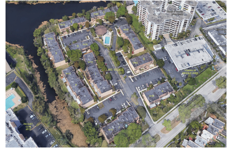
Built in 1973 - 65 units - 2 floors

Number of units: 65 Number of active listings for rent: 0 Number of active listings for sale: 2 Building inventory for sale: 3% Number of sales over the last 12 months: 7 Number of sales over the last 6 months: 2 Number of sales over the last 3 months: 0