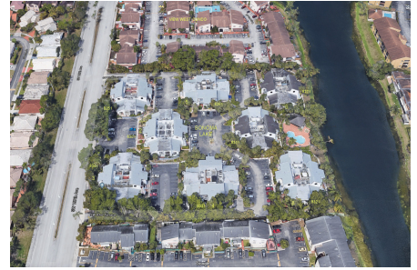
Built in 1982 - 94 units - 3 floors