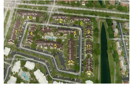
Built in 1989 - 232 units - 2 floors

Biscayne Beach Club Condo Association 15600 SW 104th Ter, Miami, FL 33196 (305) 960-7802