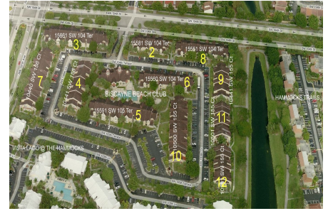
Built in 1989 - 232 units - 2 floors

Biscayne Beach Club Condo Association 15600 SW 104th Ter, Miami, FL 33196 (305) 960-7802