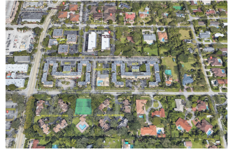
Built in 1968 - 128 units - 3 floors

Gallowood Condominium Address: 8475 SW 94th St, Miami, FL 33156 Phone: +1 305-595-9775