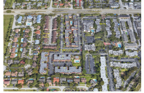
Built in 1968 - 176 units - 3 floors

Puerta Del Sol of Kendall Condominium Address: 9958 N Kendall Dr, Miami, FL 33176 +1 305-326-9827