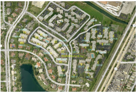
Built in 1972 - 628 units - 2 floors

Residences At The Fall 13841 SW 90th Ave, Miami, FL 33176 (305) 232-3919