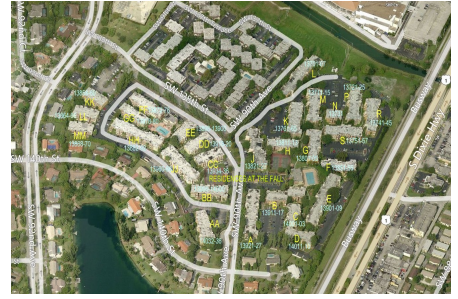
Built in 1972 - 628 units - 2 floors

Residences At The Fall 13841 SW 90th Ave, Miami, FL 33176 (305) 232-3919