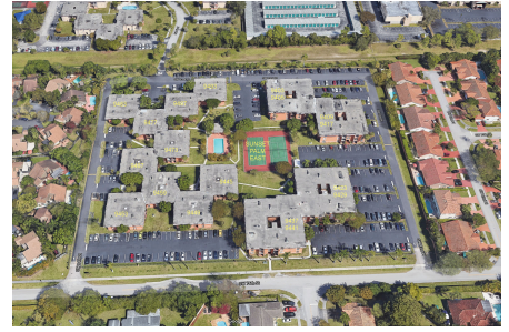
Built in 1969 - 176 units - 3 floors

Sunset Palms Condominium Association 7256 SW 94th Pl Miami, FL 33173 (305) 274-1586