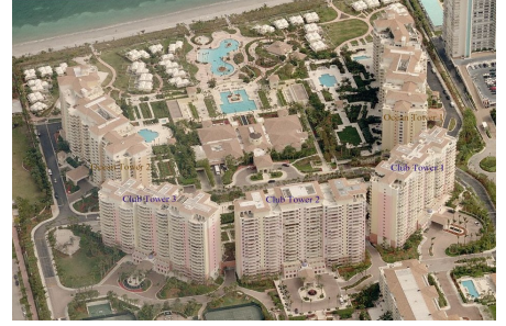
Built in 1998 - 94 units - 18 floors

http://www.oceanclubkeybiscayne.org/Default.aspx?p=DynamicModule&pageid=301066&s