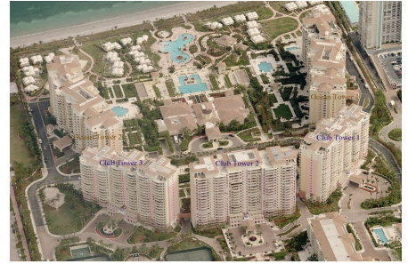
Built in 1998 - 94 units - 18 floors

http://www.oceanclubkeybiscayne.org/Default.aspx?p=DynamicModule&pageid=301066&s