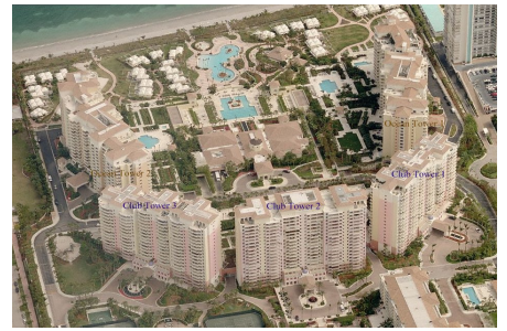
Built in 1998 - 100 units - 18 floors

http://www.oceanclubkeybiscayne.org/Default.aspx?p=DynamicModule&pageid=301066&s