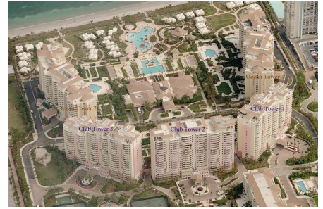
Built in 1999 - 95 units - 18 floors

http://www.oceanclubkeybiscayne.org/Default.aspx?p=DynamicModule&pageid=301066&s